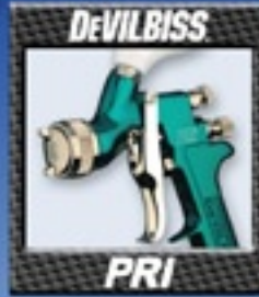
PRI Filler/Primer Gun