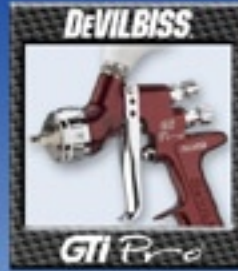
GTI Pro Topcoat Gun