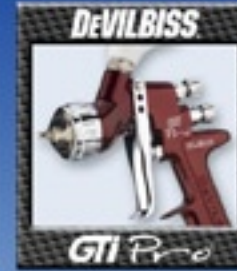
GTI Pro Topcoat Gun