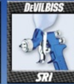
SRi Spot Repair - Topcoats