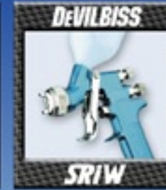
SRiW Spot Repair - Basecoats